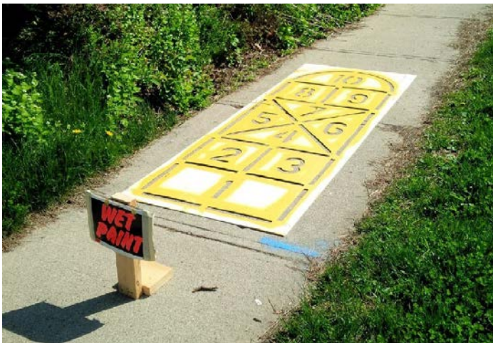
Figure 2: Hopscotch sidewalk marking stencil

The City of Waterloo hired a contractor to paint the games onto the identified walking routes. The painter had experience in painting similar activities on school play-yards. He designed his own original stencils for the sidewalk markings, including ones that invite students to run, walk, hop or skip by following footsteps, or to play hopscotch (see Figure 2 for an example of the installation). The painter also researched paints for concrete sidewalks versus asphalt surfaces, as this was his first attempt at painting on concrete. It was unclear how different types of paint would stand up over time and changing seasons, so the committee agreed to evaluate the state of the paint one year after installation.