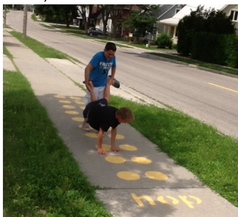
Figure 3: Grade 6 students

Asked if the school signage project was a good idea, almost every student who offered a comment was positive about the project. Dozens of students commented on how fun it was to play the activities suggested on the sidewalks. The mostly grade five and six students observed younger children and students enjoying the sidewalk activities (see below). But most weren't afraid to admit that they enjoyed them too.